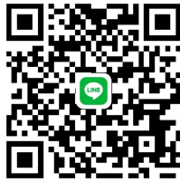
Via Line App