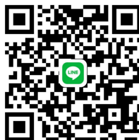
Via Line App