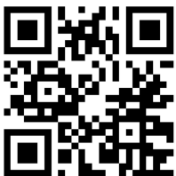
Via Viber App